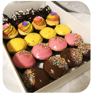
Mini Cupcake Box