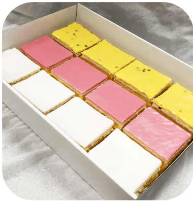
Vanilla Slice Box