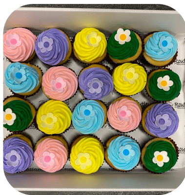
Rainbow Mini Cupcake Box