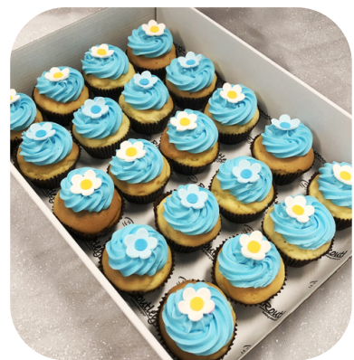
Blue Mini Cupcake Box (Pink also available)