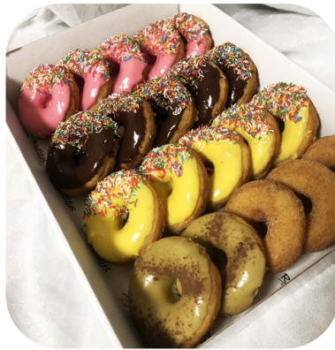
Cake Donut Box