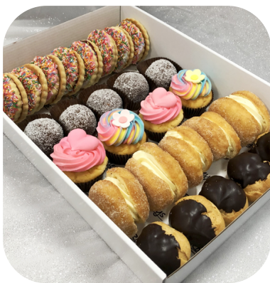
High Tea Box